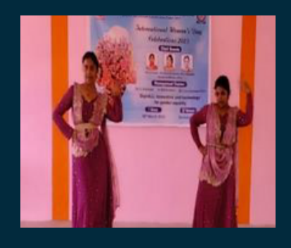
Womens' Day celebration