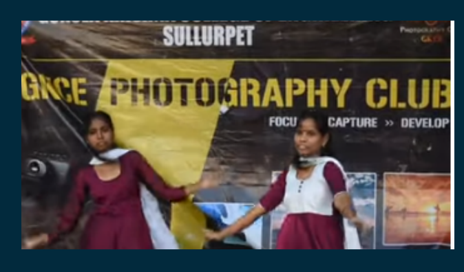
Photography club inauguration